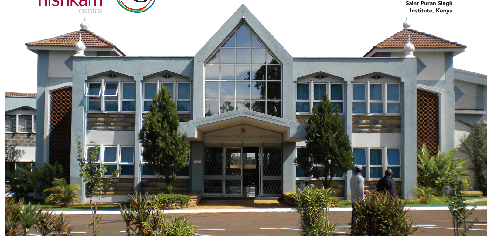
Below: Nishkam Saint Puran Singh Institute, Kenya