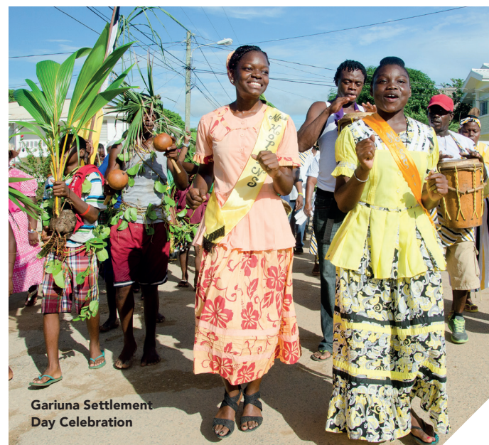
Gariuna Settlement Day Celebration