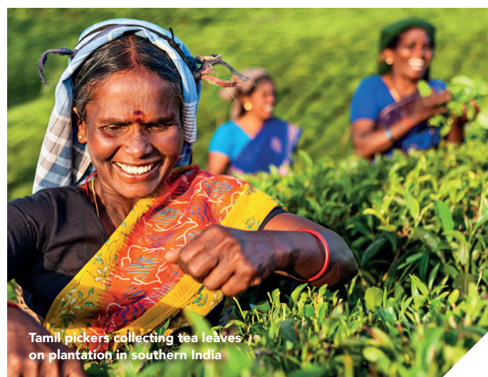
Tamil pickers collecting tea leaves on plantation in southern India

In addition to the current work programme, the group is making progress towards ensuring the linkages and facilitation to: