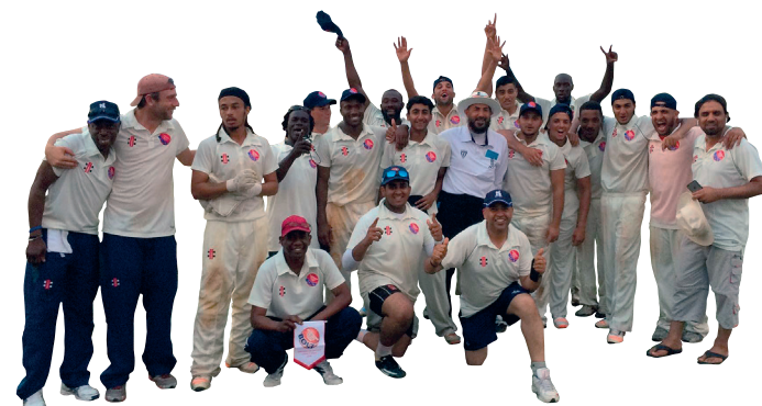
Above: Jamaica Legacy Cricket Tour