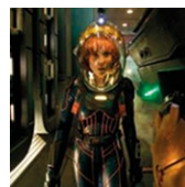
Helmets made by CMA Moldform in Ridley Scott's Prometheus film

Europe has an important part to play in the fortunes of successful Birmingham mouldings and castings SME, CMA Moldform. The company has developed a strong trading relationship with Germany, Spain and France and increasing